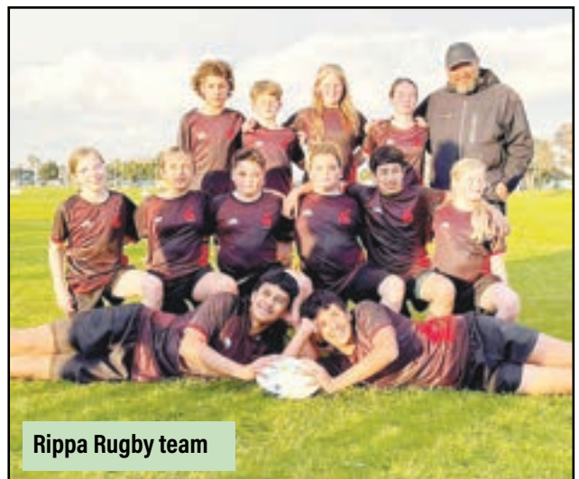
Rippa Rugby team