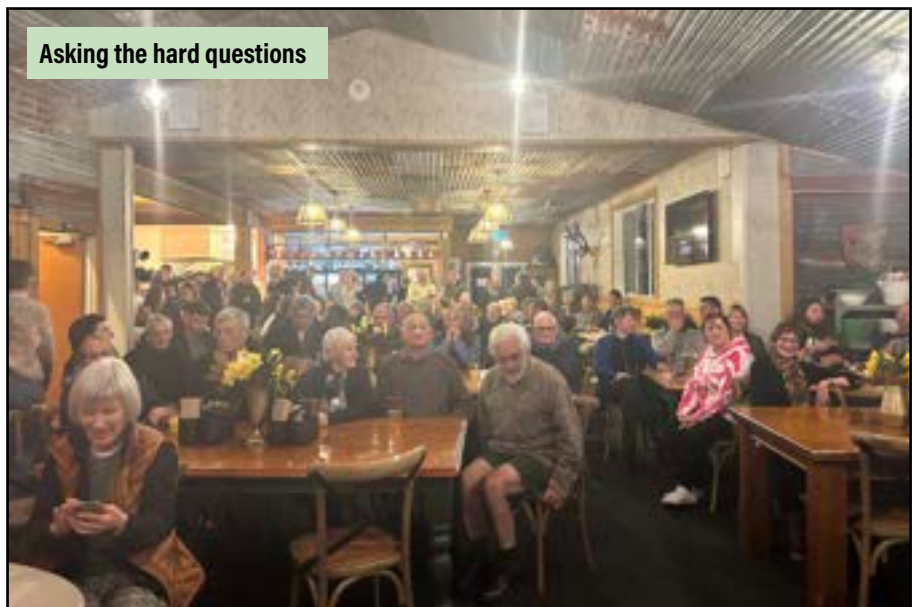
Asking the hard questions